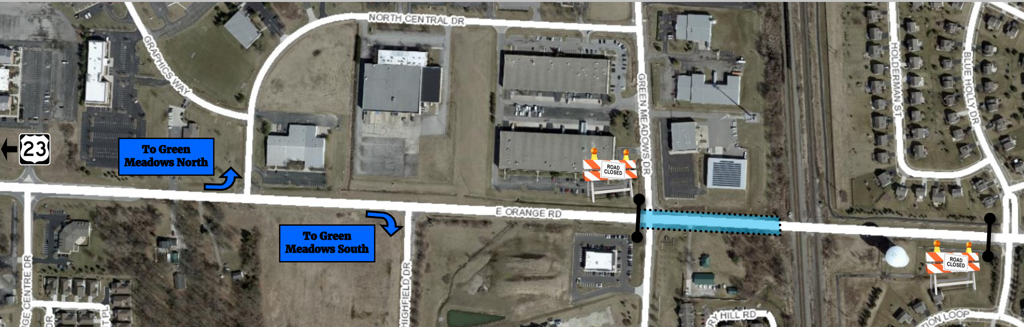
Part 2— Road Closure from June to July 2021